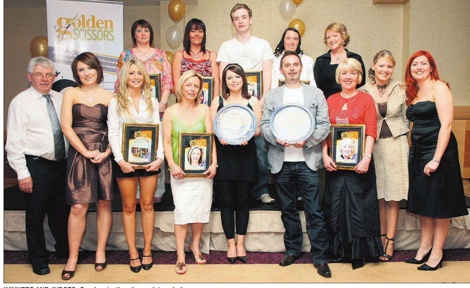
WINNERS AND JUDGES: See key to the above picture below.