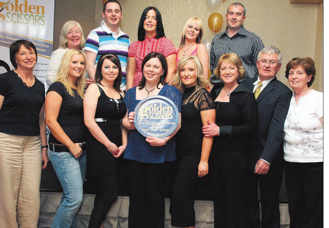
SHEER FLAIR: The Flair Hair Salon team are all smiles after collecting their award.